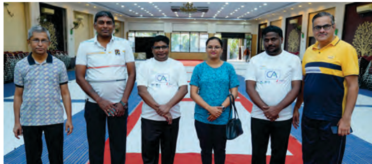
Group Photo of 9th International Day of Yoga