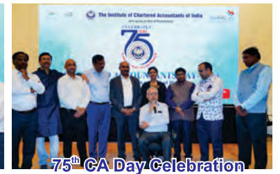
75 th CA Day Celebration