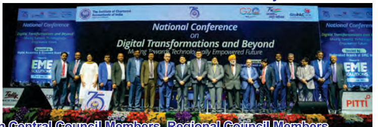
Group photo with President & Vice President ICAI seen Central Council Members, Regional Council Members, Managing Committee Members of Hyderabad Branch of SIRC of ICAI at National Conference held on 7 – 8 July, 2023