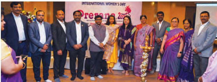
Lighting of the lamp along with Members at Prerana 2023 Womens Seminar