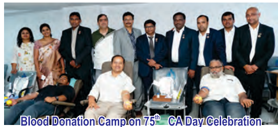
Blood Donation Camp on 75 th CA Day Celebration