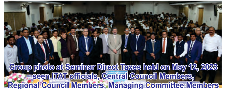
Group photo at Seminar Direct Taxes held on May 12, 2023 seen IITAT officials, Central Council Members, Regional Council Members, Managing Committee Members of Hyderabad Branch of SIRC of ICAI