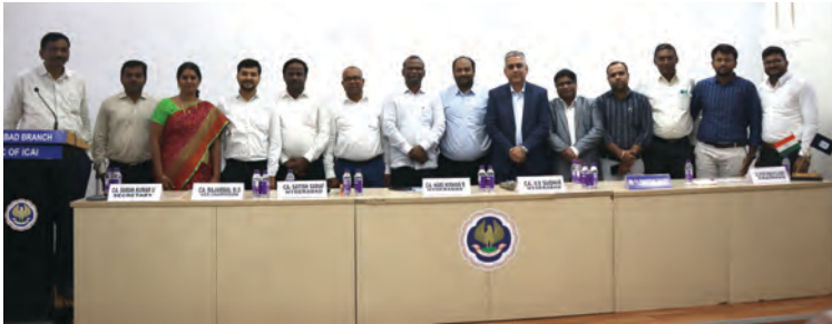
Group Photo of all Members at Workshop on Basics of GST