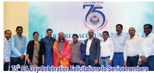
75 th CA Day Celebration Felicitations to Senior members