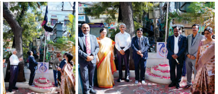
75 th CA Day Flag Hoisting