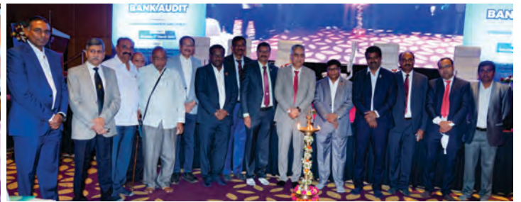
Lighting of the lamp along with Members at Seminar on Bank Audit