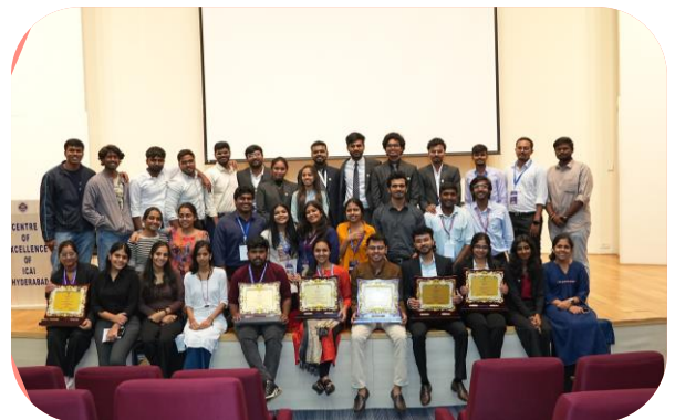
Snapshots from Valedictory Session of Regional Level National Talent Search 2025, where participants have come across from Southern Region, held on 1 st February, 2025 at Centre of Excellence, Hyderabad.